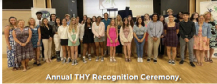
Annual THY Recognition Ceremony.