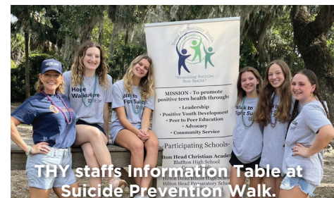
THY staffs Information Table at Suicide Prevention Walk.