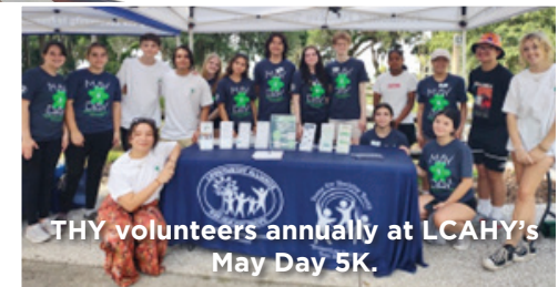
THY volunteers annually at LCAHY's May Day 5K.