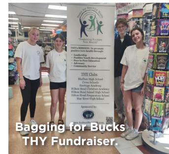
Bagging for Bucks THY Fundraiser.