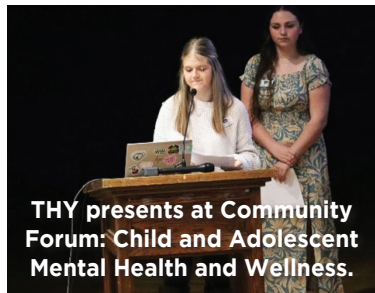
THY presents at Community Forum: Child and Adolescent Mental Health and Wellness.