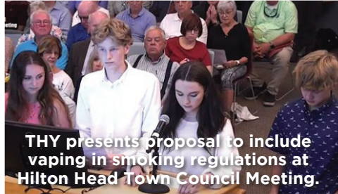
THY presents proposal to include vaping in smoking regulations at Hilton Head Town Council Meeting.