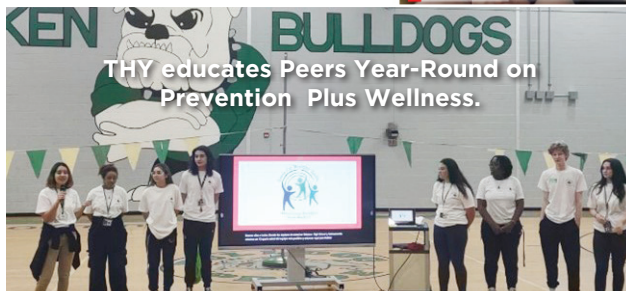
THY educates Peers Year-Round on Prevention Plus Wellness.