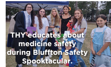
THY educates about medicine safety during Bluffton Safety Spooktacular.