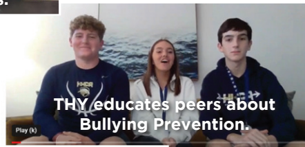
THY educates peers about Bullying Prevention.