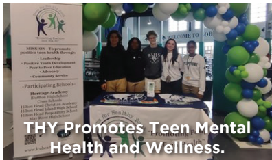
THY Promotes Teen Mental Health and Wellness.