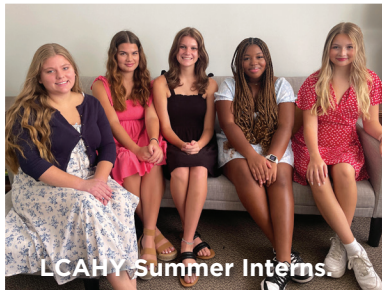
LCAHY Summer Interns.